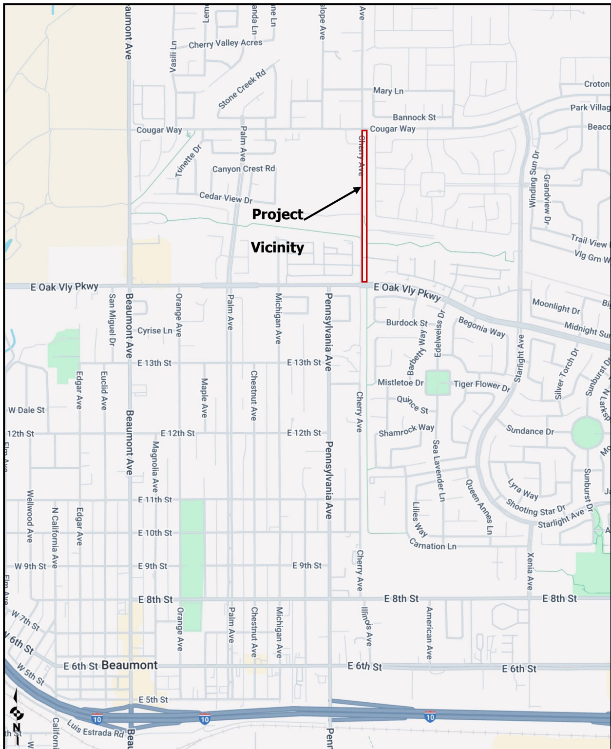
Figure 1: Project Vicinity